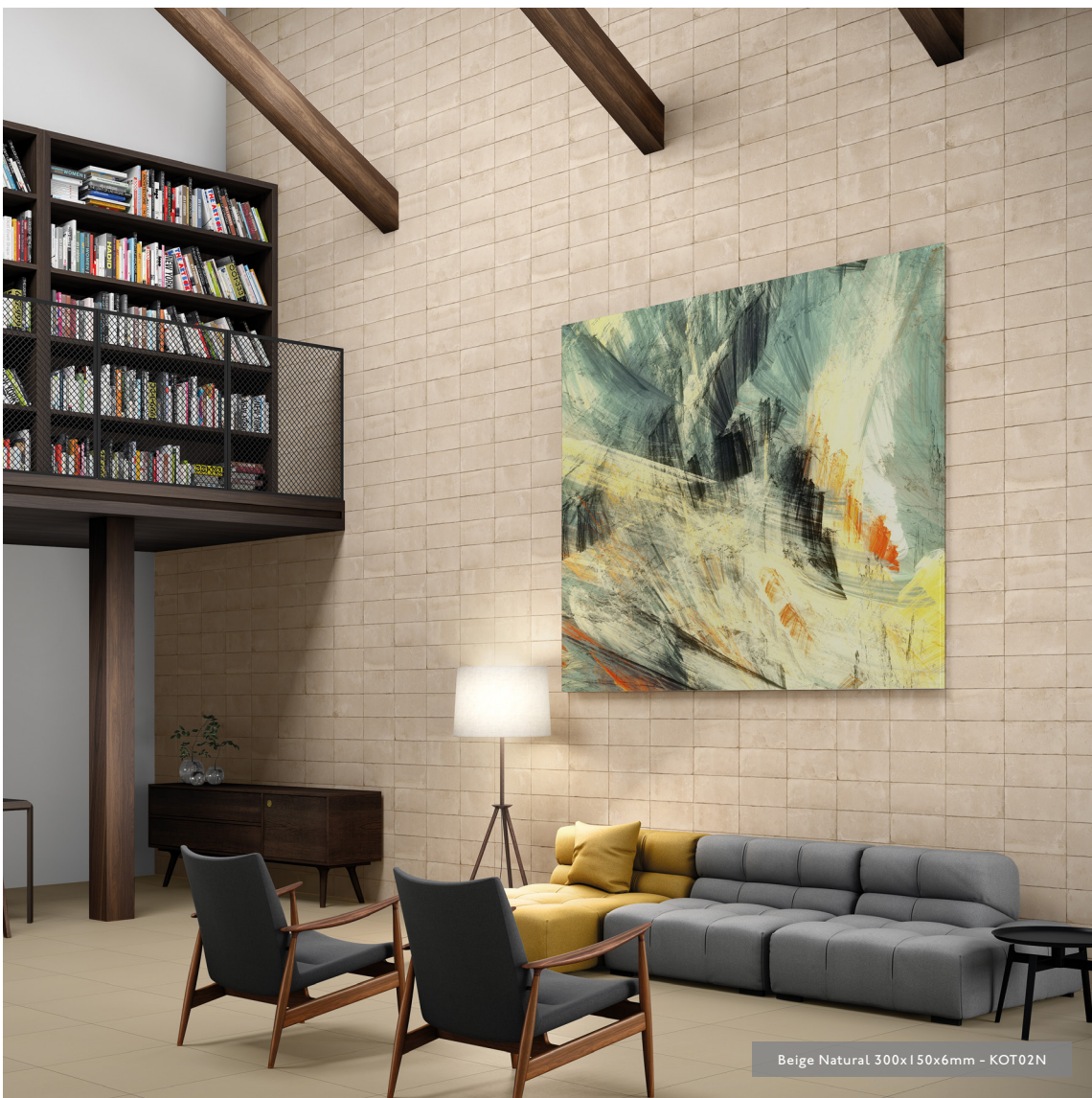
Beige Natural 300x150x6mm - KOT02N