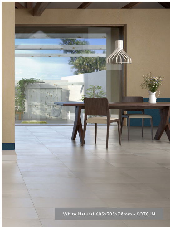
White Natural 605x305x7.8mm - KOT01N