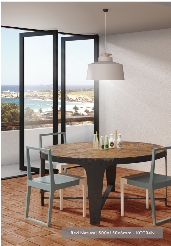
Red Natural 300x150x6mm - KOT04N