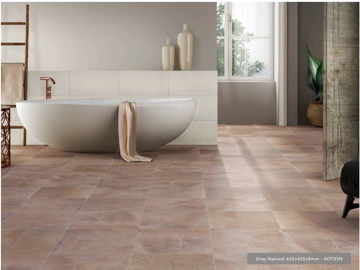
Grey Natural 455x455x8mm - KOT03N

Note: Class Bla & B1b: Glazed Porcelain Tiles. For more information please see the suitability advice given in the technical section. All sizes indicated are metric modular. All sizes shown are nominal. For the most up-to-date size, colour and finish availability, please visit our website - www.johnson-tiles.com .