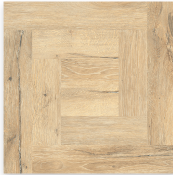
OAK MAIZE N GLW02M PEI: IV LRV: 40