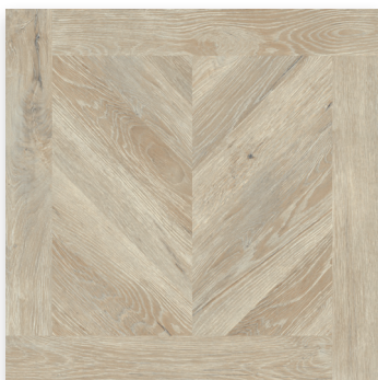
BIRCH CHEVRON N GLW01V PEI: IV LRV: 42