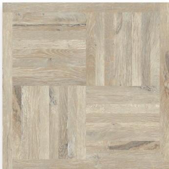
BIRCH BASKETWEAVE N GLW01B PEI: IV LRV: 42