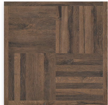
WALNUT BASKETWEAVE N GLW03B PEI: III LRV: 15