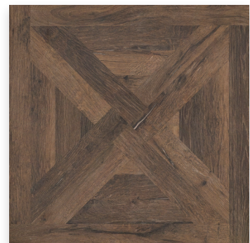
WALNUT CROSS N GLW03C PEI: III LRV: 15