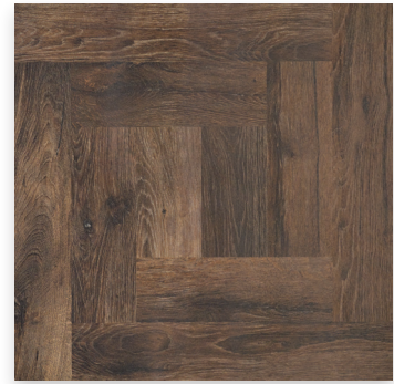
WALNUT MAIZE N GLW03M PEI: III LRV: 15