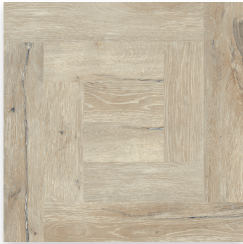
BIRCH MAIZE N GLW01M PEI: IV LRV: 42