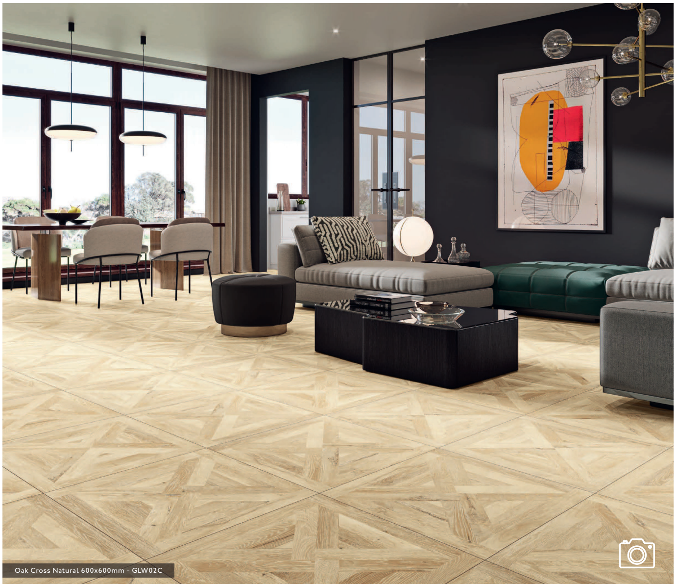
Oak Cross Natural 600x600mm - GLW02C

Note: All sizes indicated are metric modular. All dimensions are in millimetres. All sizes shown are nominal. For the most up-to-date availability information, please visit our website. All LRV results are from Johnson Tiles' internal test reports and are to be used for guidance only. LRV: Light Reflectance Value.