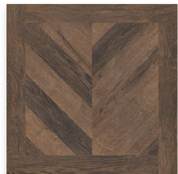
WALNUT CHEVRON N GLW03V PEI: III LRV: 15