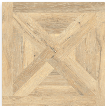
OAK CROSS N GLW02C PEI: IV LRV: 40