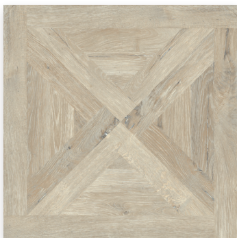
BIRCH CROSS N GLW01C PEI: IV LRV: 42