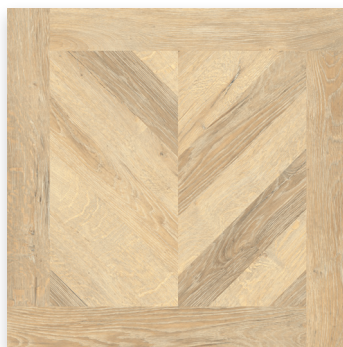
OAK CHEVRON N GLW02V PEI: IV LRV: 40