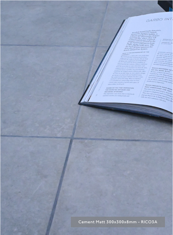
Cement Matt 300x300x8mm - RICO3A