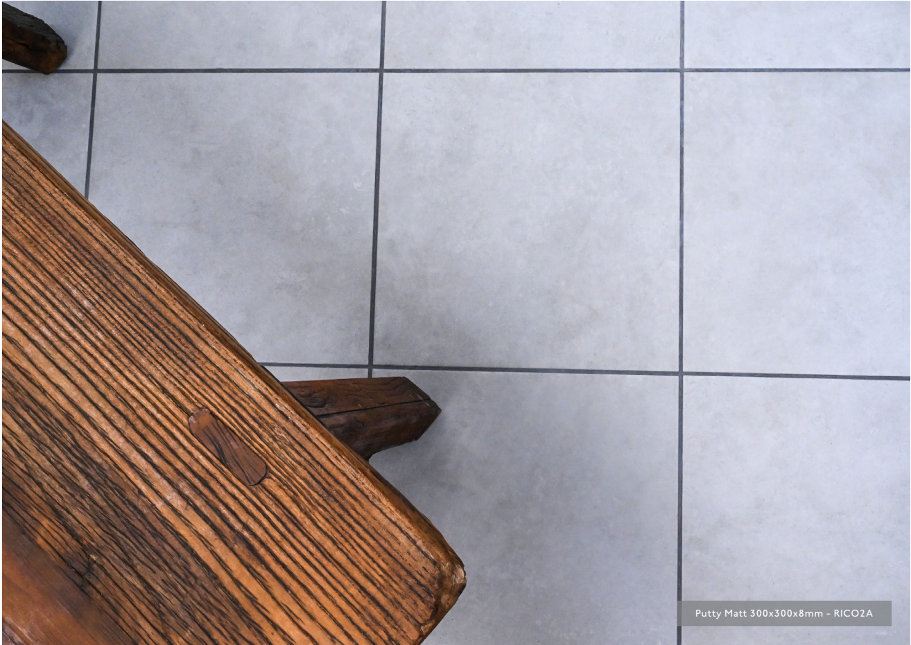
Putty Matt 300x300x8mm - RICO2A