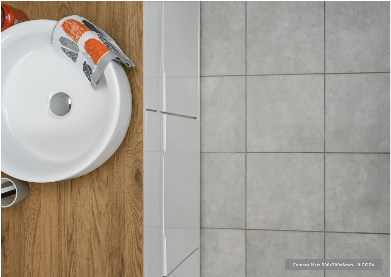
Cement Matt 300x300x8mm - RICO3A

Note: All 300x300mm glazed ceramic [BIII] products in the matt finish are suitable for internal domestic floor applications. All sizes indicated are metric modular. All sizes shown are nominal. For the most up-to-date size, colour and finish availability, please visit our website - www.johnson-tiles.com .