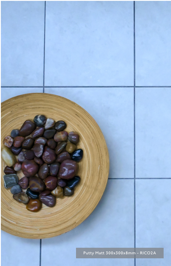
Putty Matt 300x300x8mm - RICO2A