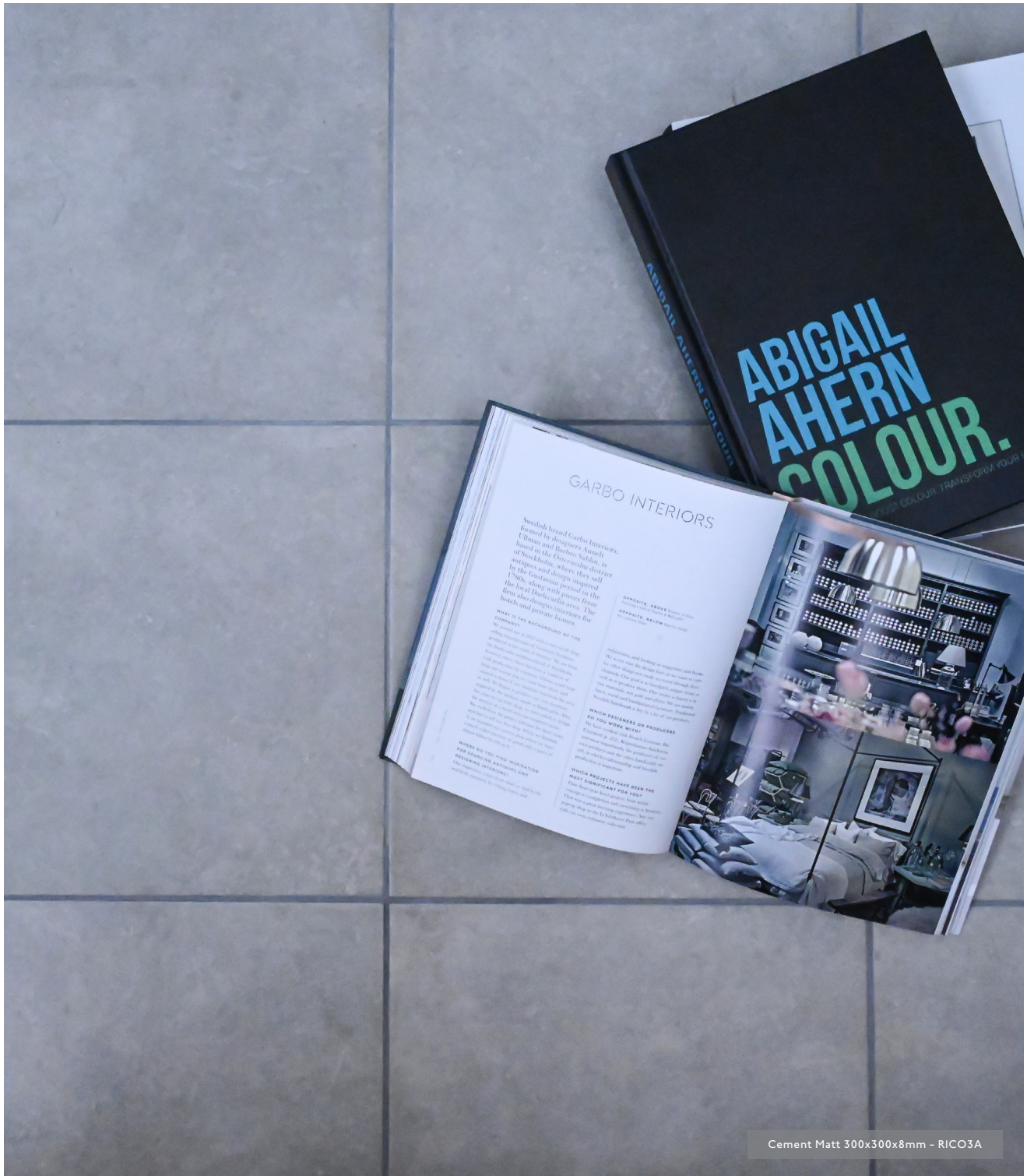
Cement Matt 300x300x8mm - RICO3A

With its calming neutral tones, Rico offers the perfect solution to domestic spaces. Subtle delicate details are explored in White and Grey shades, creating a naturally soft and organic feel. Available in a sophisticated 300x300mm size-format, Rico can easily be paired with a variety of wall colours and textures to compliment any style or space.