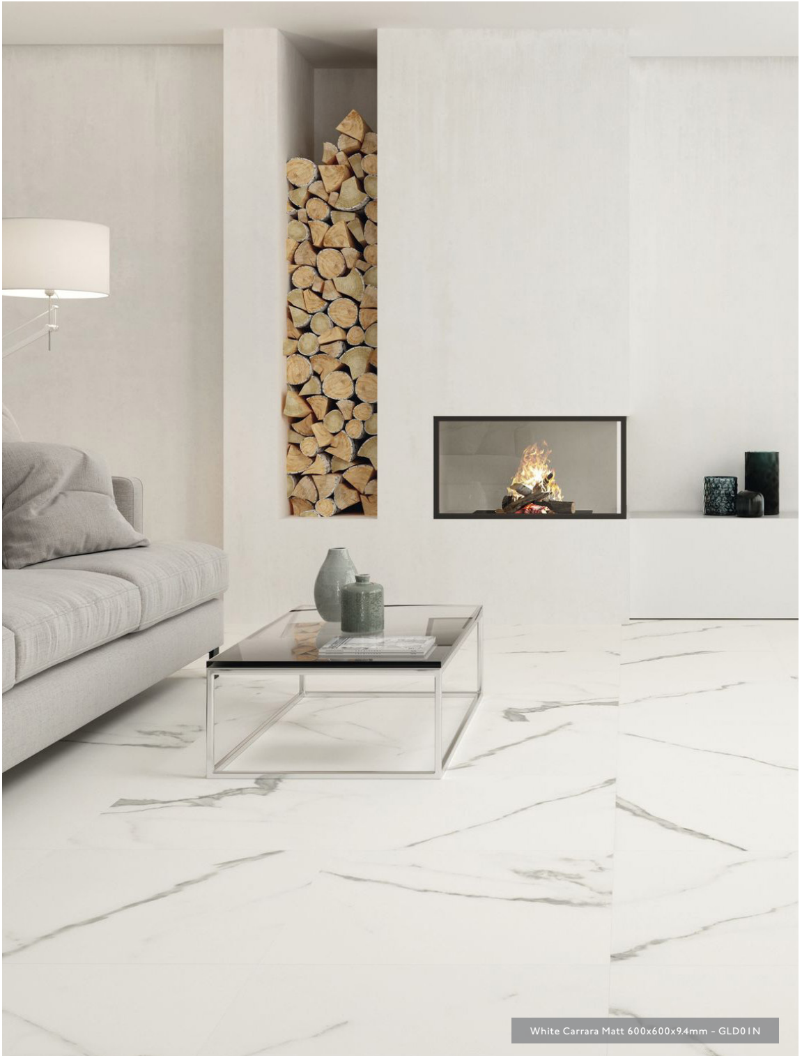
White Carrara Matt 600x600x9.4mm - GLD01N

With the calming, neutral tone of pure white threaded with the gentle veining of carrara marble, Glide proves that simplicity can still make a big impact. Understated and elegant, Glide showcases calm serenity with a timeless finish, expanding the limits of any space with an airy, light, bright feel - perfectly delivering clean, sleek looks, bringing sophistication and style to any setting.