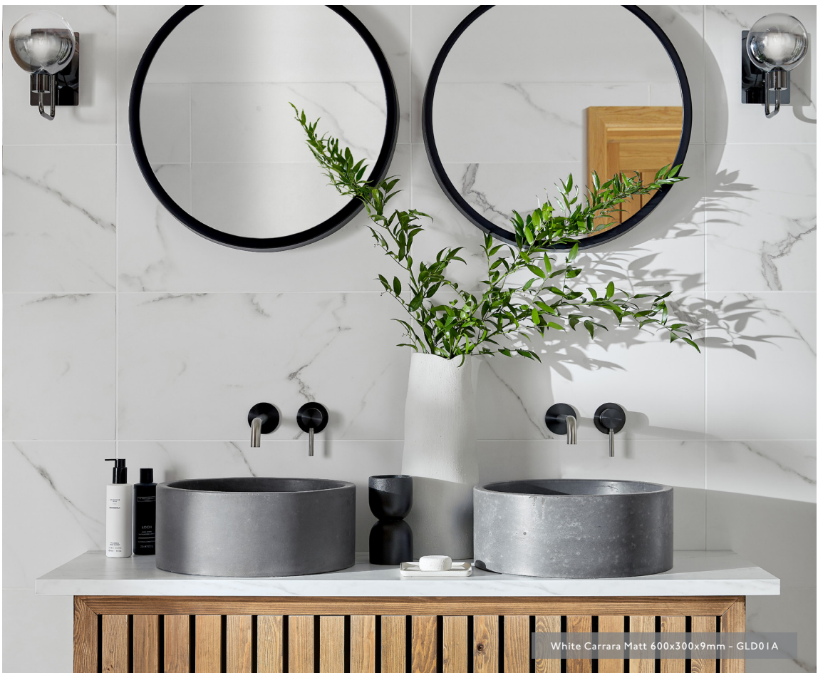
White Carrara Matt 600x300x9mm - GLD01A

Note: Porcelain [Bla & B1b] and Ceramic Tiles [B111]. For more information please see the suitability advice given in the technical section. All sizes indicated are metric modular. All sizes shown are nominal. For the most up-to-date size, colour and finish availability, please visit our website - www.johnson-tiles.com . (R) Rectified Edge.