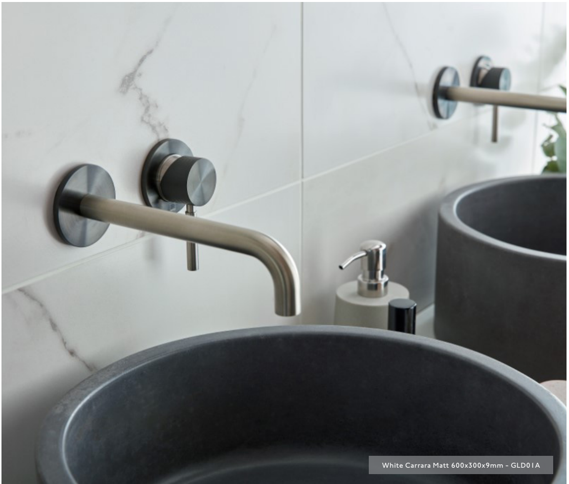
White Carrara Matt 600x300x9mm - GLD01A

The colours shown in this sample wallet and attached booklet are as accurate as printing processes will allow. Please refer to actual product samples before specifying. Every effort has been made to ensure the accuracy of the information given.