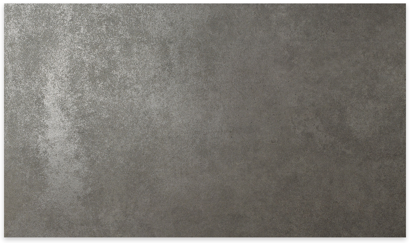
ANTHRACITE LRV: 16

Product Codes (All Sizes): N DIS03N + G DIS03G Mosaic Product Codes (All Sizes): N DIS3NM + G DIS3GM