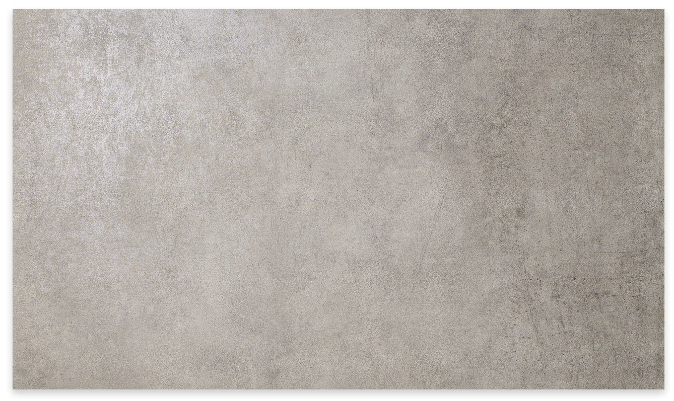
TARNISHED SILVER LRV: 31

Product Codes (All Sizes): N DIS03N + G DIS03G Mosaic Product Codes (All Sizes): N DIS3NM + G DIS3GM