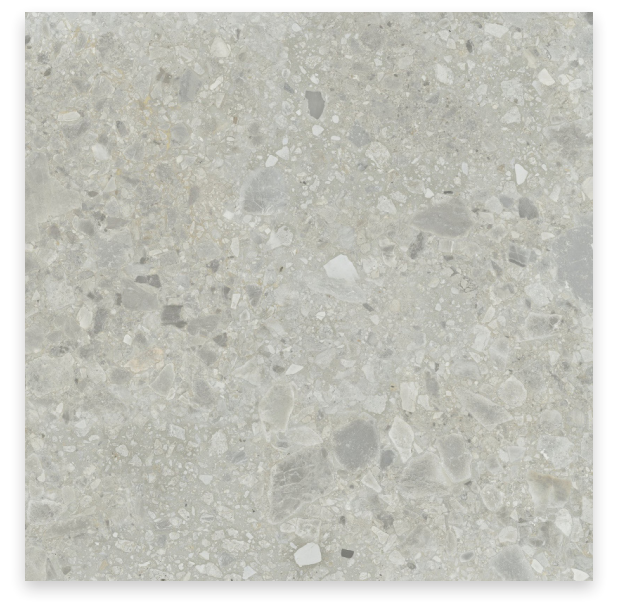
N TRZOIN + T TRZOIT PEI:IV LRV: 38