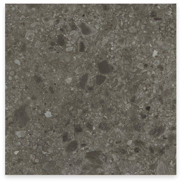
DARK STONE N TRZ02N + T TRZ02T PEI: II LRV: 16