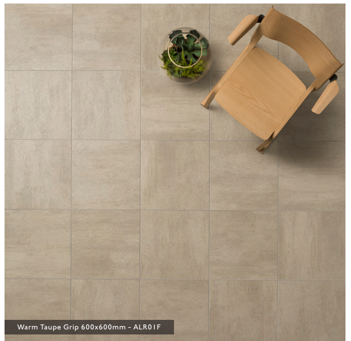
Warm Taupe Grip 600x600mm - ALR01F