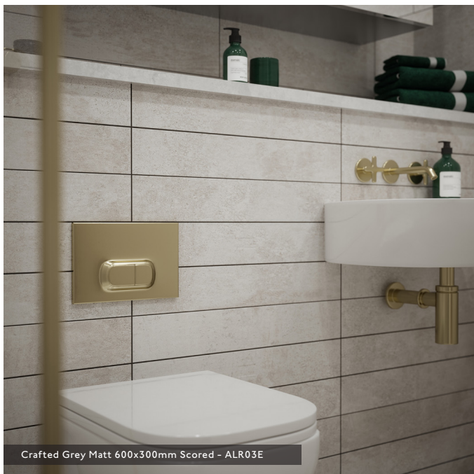
Crafted Grey Matt 600x300mm Scored - ALR03E