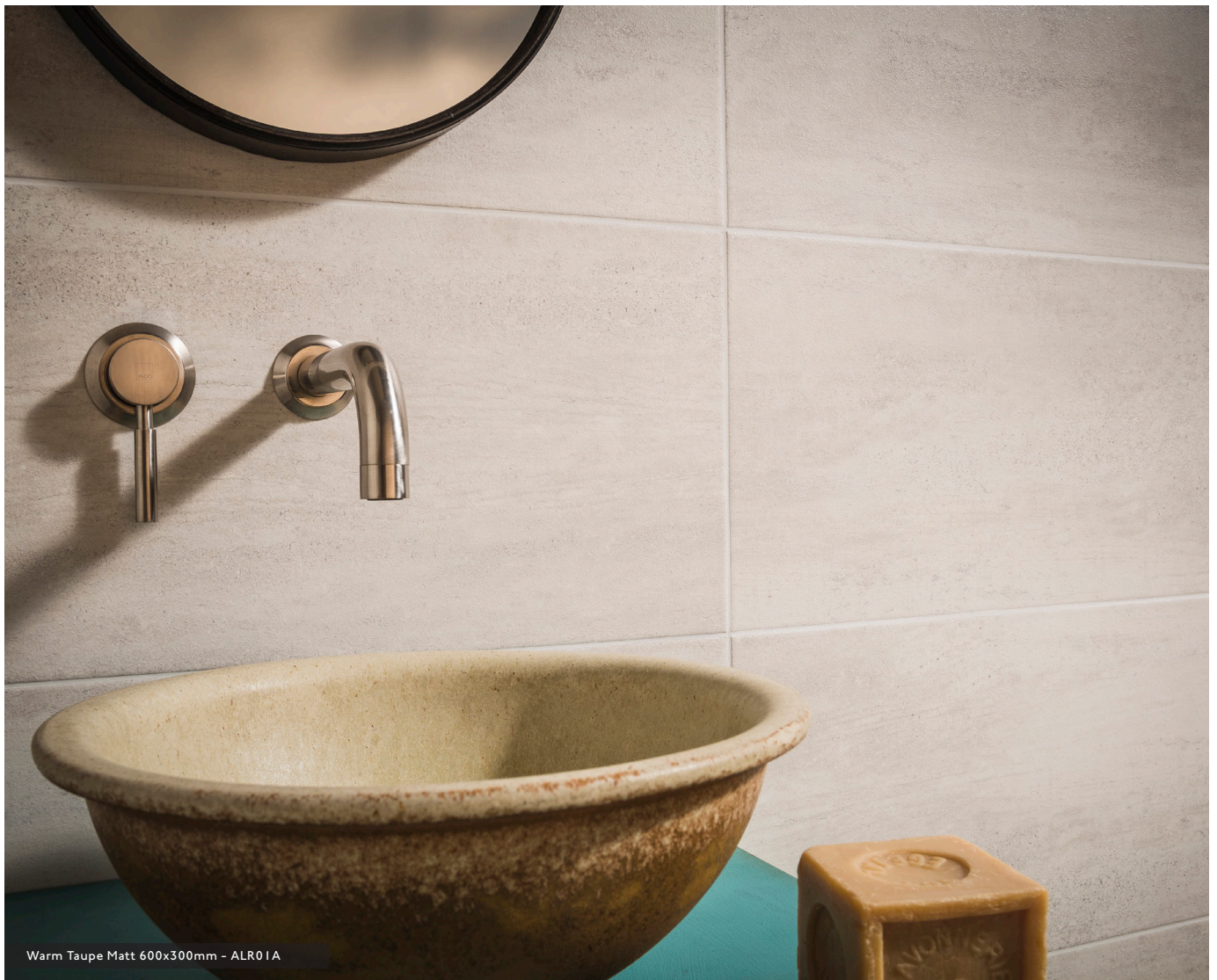
Warm Taupe Matt 600x300mm - ALR01A

Note: All sizes indicated are metric modular. All dimensions are in millimetres. All sizes shown are nominal. For the most up-to-date availability information, please visit our website. All LRV results are from Johnson Tiles' internal test reports and are to be used for guidance only. LRV: Light Reflectance Value.