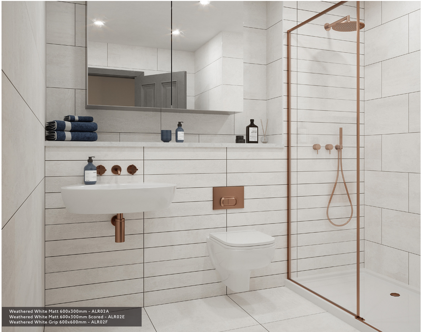
Weathered White Matt 600x300mm - ALR02A Weathered White Matt 600x300mm Scored - ALR02E Weathered White Grip 600x600mm - ALR02F