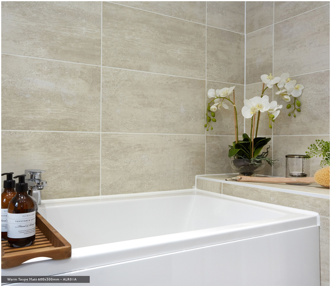
Warm Taupe Matt 600x300mm - ALR01A