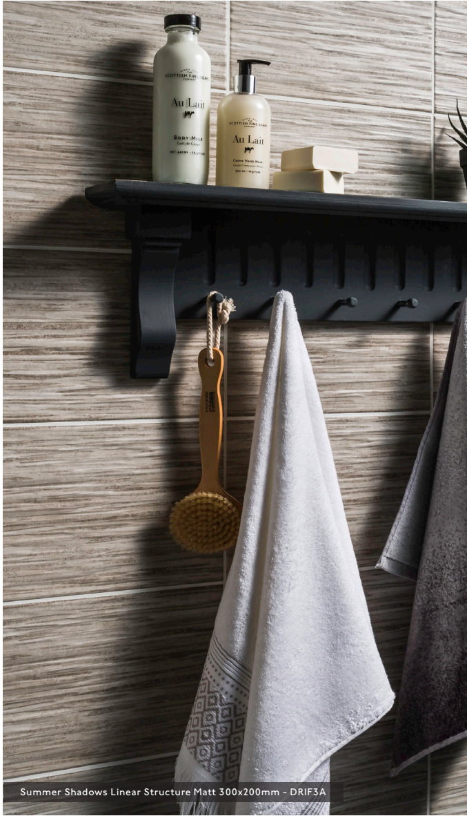
Summer Shadows Linear Structure Matt 300x200mm - DRIF3A