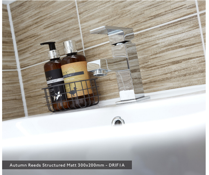
Autumn Reeds Structured Matt 300x200mm - DRIF1A