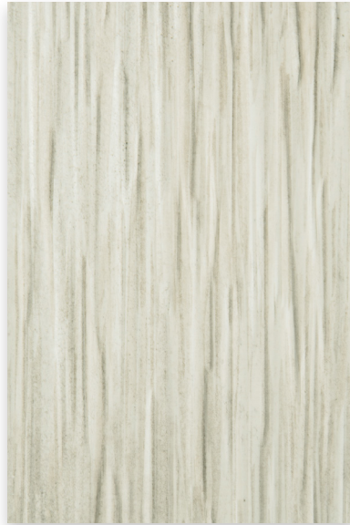
SPRING FROST LINEAR STRUCTURE