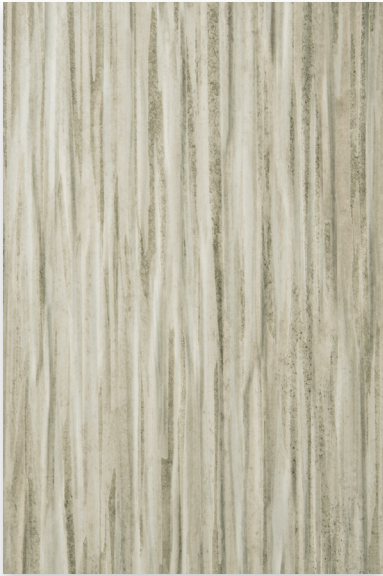
AUTUMN REEDS LINEAR STRUCTURE