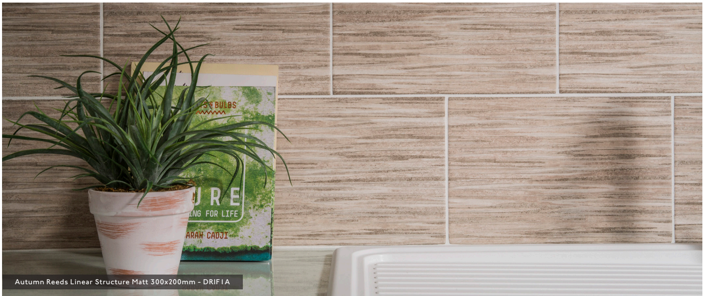
Autumn Reeds Linear Structure Matt 300x200mm - DRIF1A