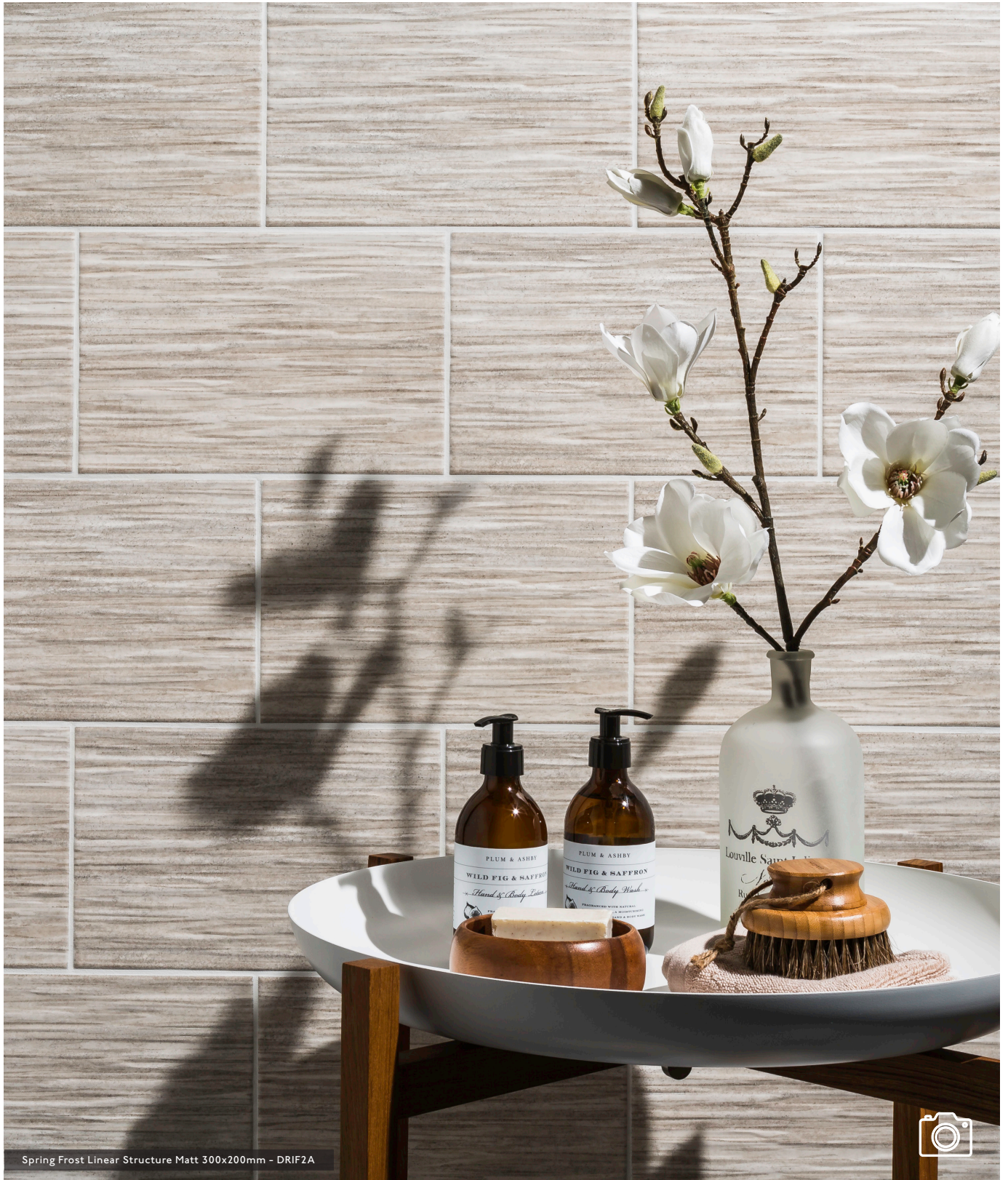
Spring Frost Linear Structure Matt 300x200mm - DRIF2A

Front Cover Image: Autumn Reeds Linear Structure Matt 300x200mm - DRIF1A