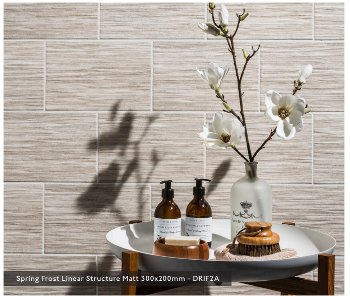
Spring Frost Linear Structure Matt 300x200mm - DRIF2A