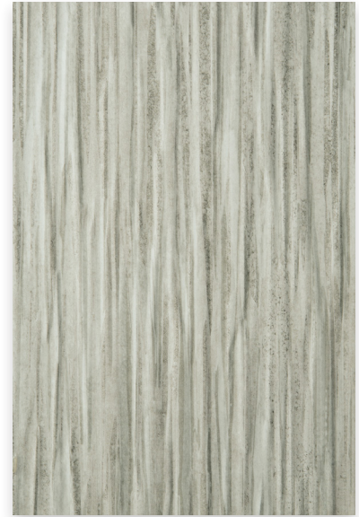
SUMMER SHADOWS LINEAR STRUCTURE