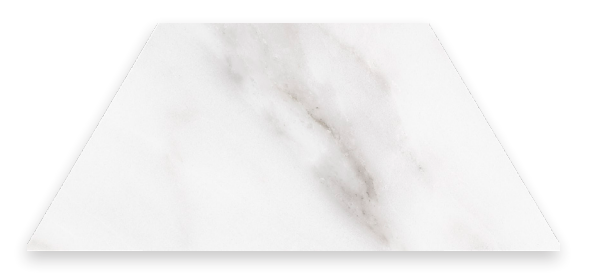
CALACATTA TRAPEZIUM N LABOIT PELIV (LRV: 65

WOOD DARK CHEVRON B N LAB4CB PEI: 11 LRV: 15