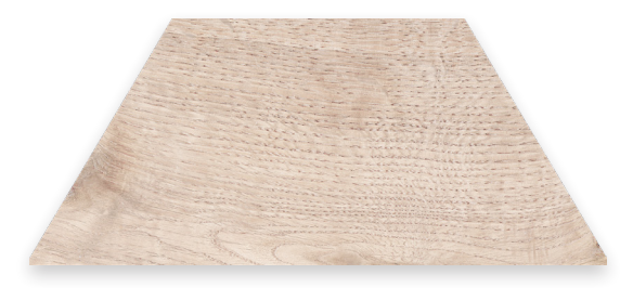
WOOD LIGHT TRAPEZIUM N LAB02T PEI: III (LRV: 50