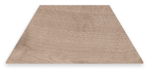
WOOD MID TRAPEZIUM N LAB03T PEI: III (LRV: 31