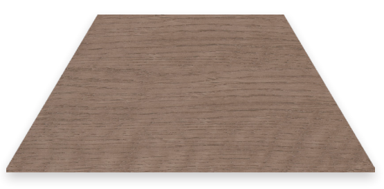
WOOD DARK TRAPEZIUM N LAB04T PEI: II (LRV: 15