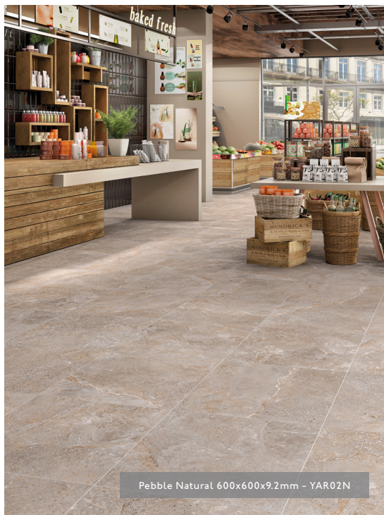
Pebble Natural 600x600x9.2mm - YAR02N