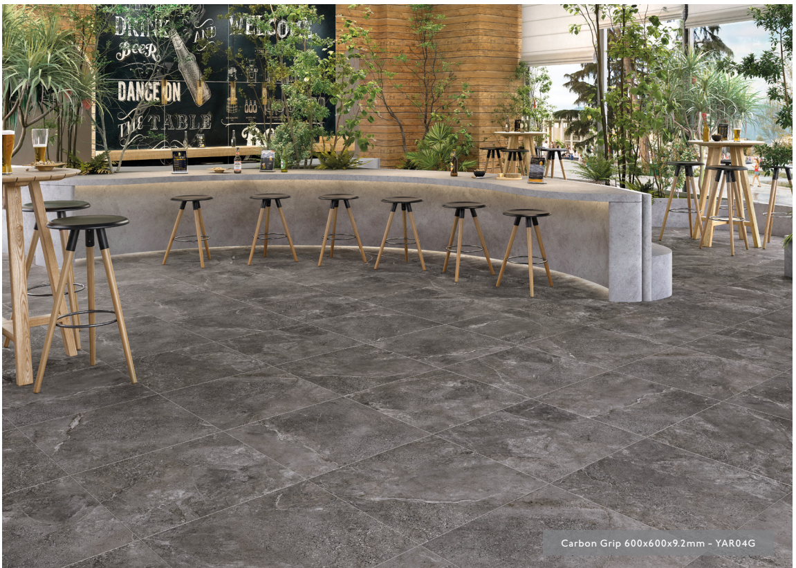
Carbon Grip 600x600x9.2mm - YAR04G

Note: (R) Rectified Edge. Class Bla: Glazed Porcelain Tiles. For more information please see the suitability advice given in the technical section. All sizes indicated are metric modular. All sizes shown are nominal. For the most up-to-date size, colour and finish availability, please visit our website - www.johnson-tiles.com .