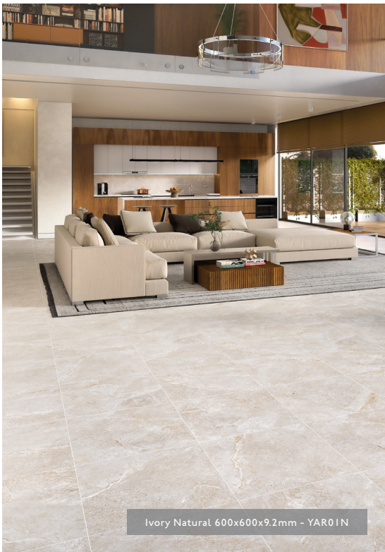
Ivory Natural 600x600x9.2mm - YAR01N