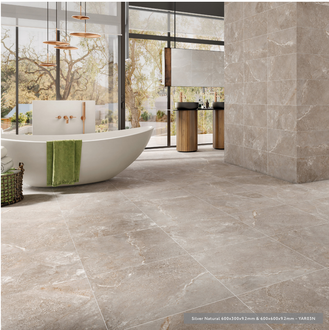
Silver Natural 600x300x9.2mm & 600x600x9.2mm - YAR03N