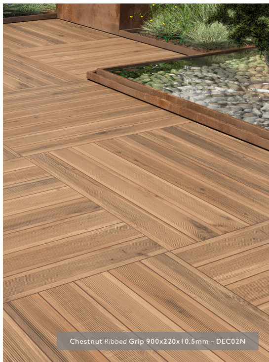
Chestnut Ribbed Grip 900x220x10.5mm - DEC02N