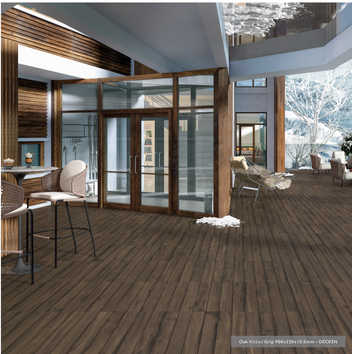
Oak Ribbed Grip 900x220x10.5mm - DEC03N