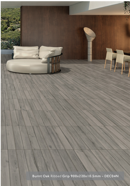
Burnt Oak Ribbed Grip 900x220x10.5mm - DEC04N