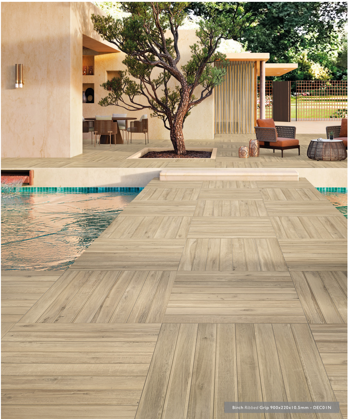
Birch Ribbed Grip 900x220x10.5mm - DEC01N

Note: Class Bla: Glazed Porcelain Tiles. For more information please see the suitability advice given in the technical section. All sizes indicated are metric modular. All sizes shown are nominal. For the most up-to-date size, colour and finish availability, please visit our website - www.johnson-tiles.com .