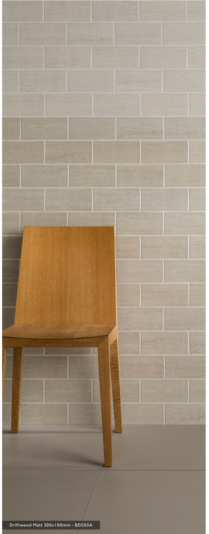
Driftwood Matt 200x100mm - BEG03A