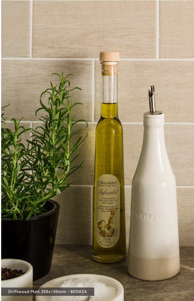
Driftwood Matt 200x100mm - BEG03A