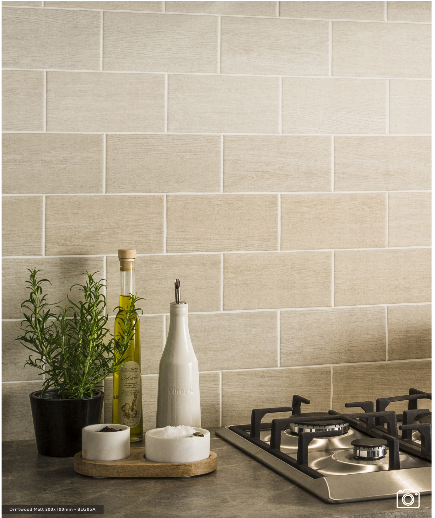
Driftwood Matt 200x100mm - BEG03A

Front Cover Image: BEG01A & Driftwod Matt 200x100mm - BEG03A