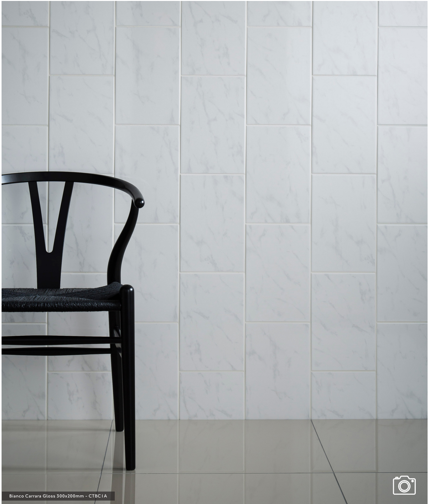
Bianco Carrara Gloss 300x200mm - CTBC1A

Front Cover Image: Buxton Satin 300x200mm - BXTONA