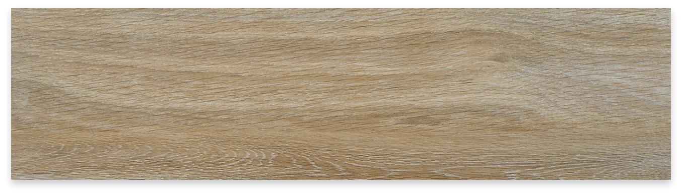
OAK LRV: 31 PEI: IV

Product Codes: N MALOIN + G MALOIG | Fitting Codes: N MALINS