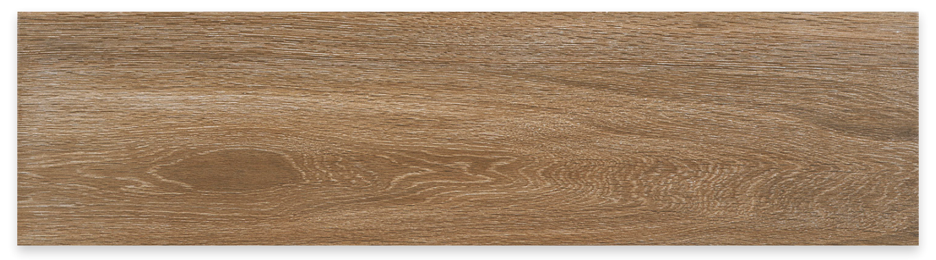
CHESTNUT LRV: 22 PEI: IV

Product Codes: N MAL02N + G MAL02G | Fitting Codes: N MAL2NS