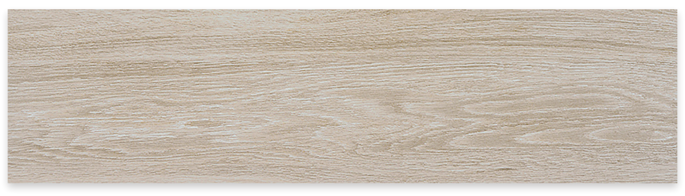
BIRCH LRV: 40 PEI: IV

Product Codes: N MALOIN + G MALOIG | Fitting Codes: N MALINS