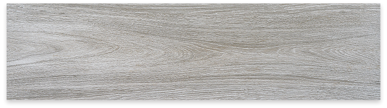
ASH LRV: 24 PEI: IV

Product Codes: N MAL03N + G MAL03G | Fitting Codes: N MAL3NS