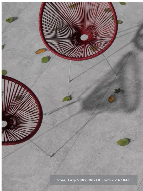
Steel Grip 900x900x10.5mm - ZAZ04G