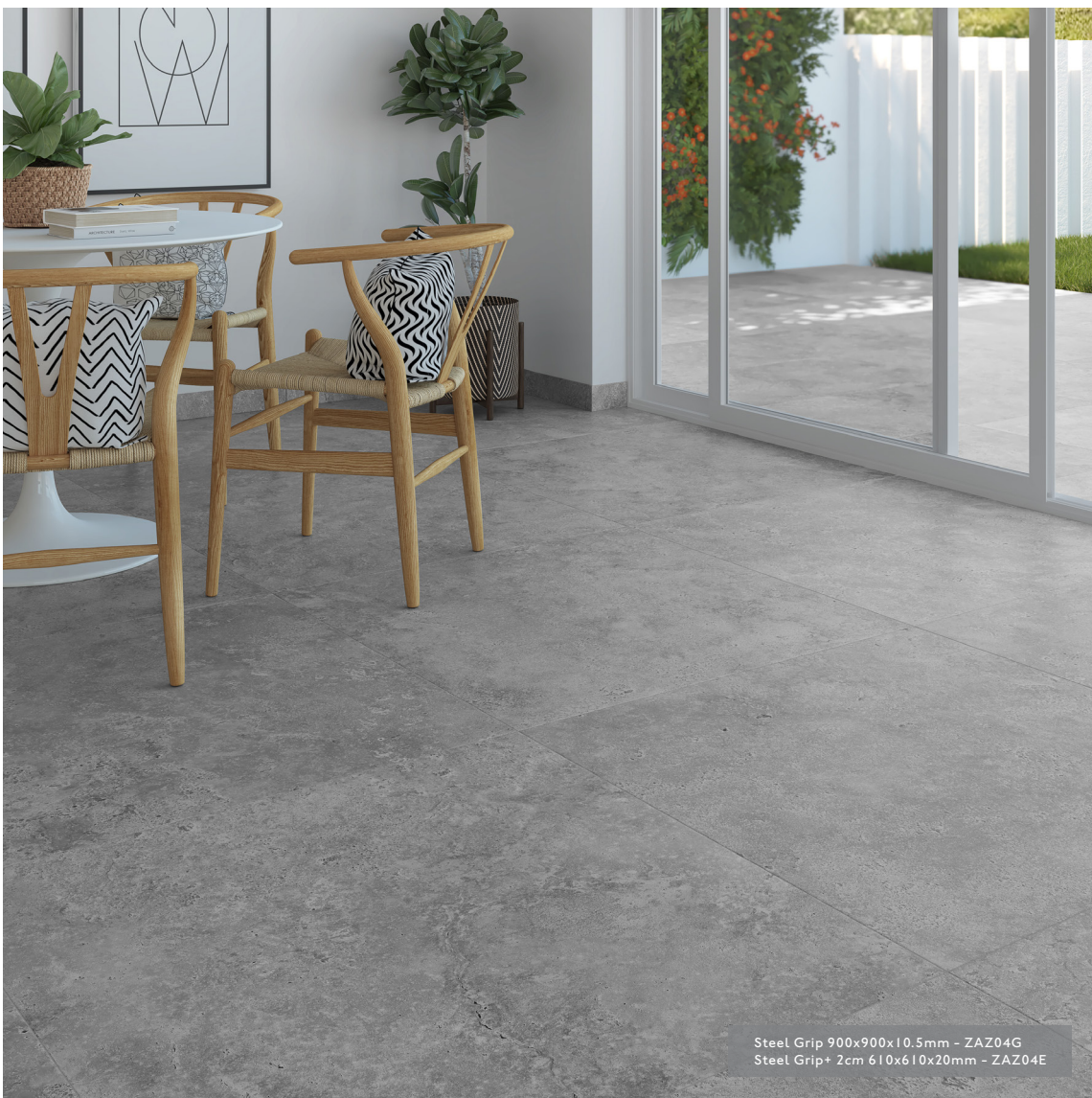
Steel Grip 900x900x10.5mm - ZAZ04G Steel Grip+ 2cm 610x610x20mm - ZAZ04E