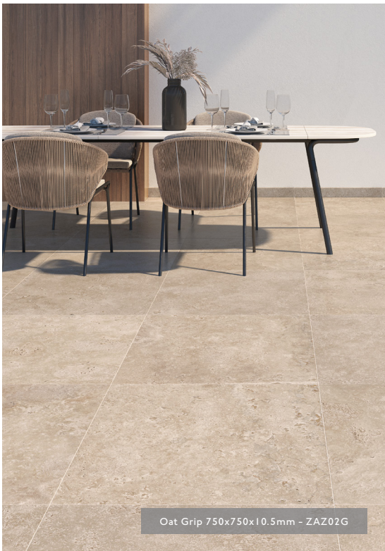
Oat Grip 750x750x10.5mm - ZAZ02G