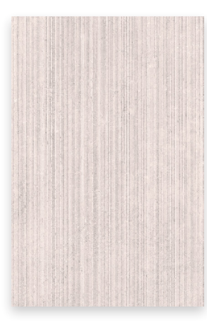
SHADOW LINEAR G ECHO2L LRV: 64