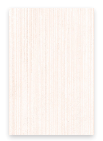
GLACIER LINEAR G ECHOIL LRV: 73