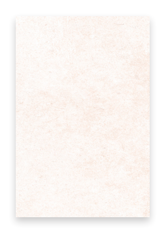
GLACIER G ECHOIA LRV: 73