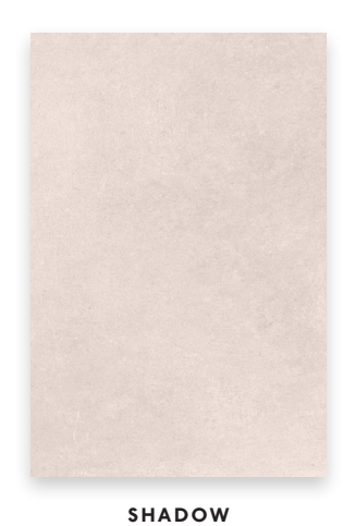
G ECHO2A LRV: 64