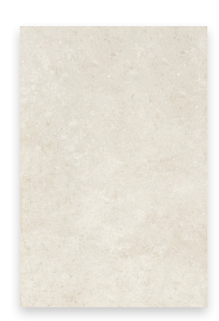
DESERT G ECHO3A LRV: 55