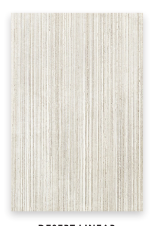
DESERT LINEAR G ECHO3L LRV: 55